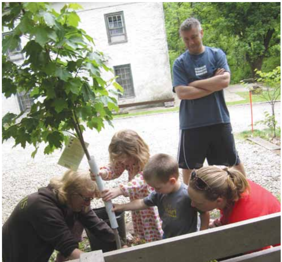
PHS provided free trees to homeowners in Northeast Philadelphia as part of Plant One Million.