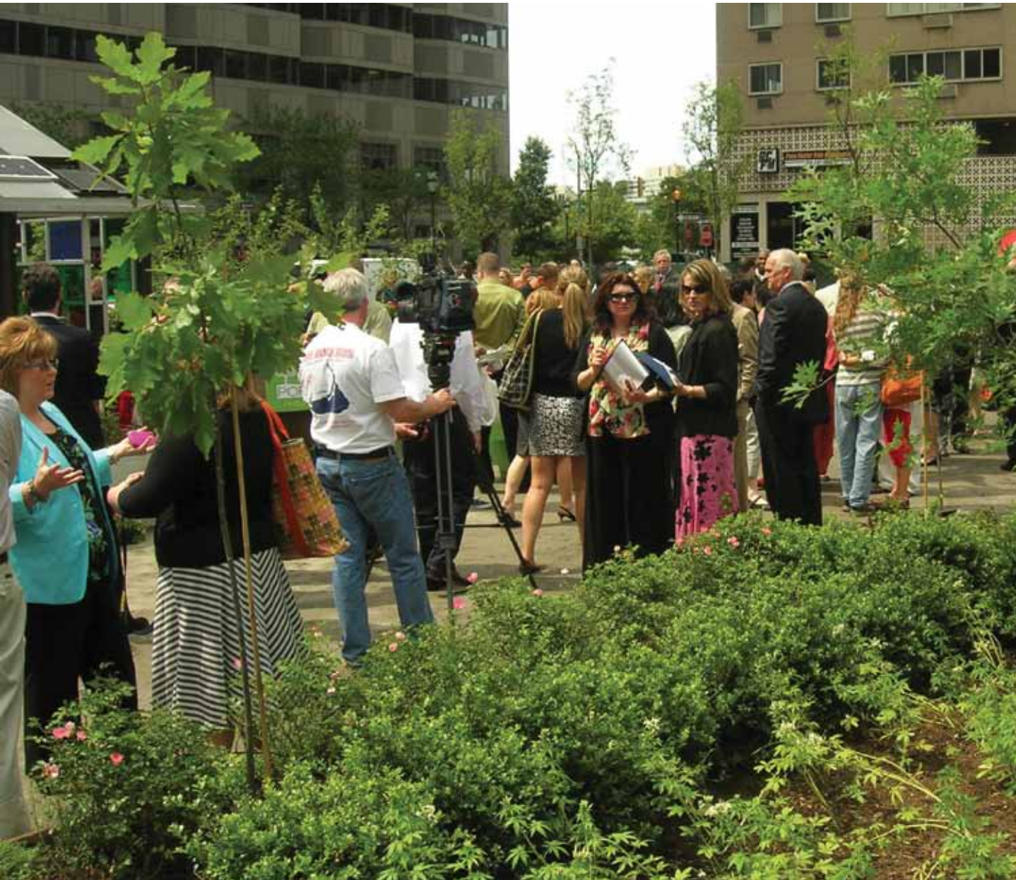
The PHS Pop Up Garden at 20th & Market streets drew 6,000 visitors over five months.